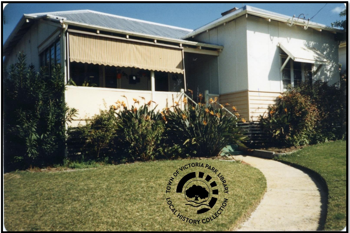
PH00038-15 The house at 7 Read Street, East Victoria Park, unknown date.